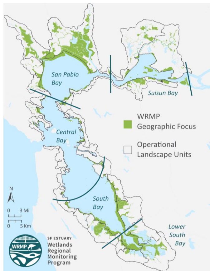
Within the five subregions of the Bay, the geographic focus of the WRMP is the portion of the complete tidal marsh ecosystem approximated by the green areas on the map. The WRMP may use Operational Landscape Units in planning and assessment.