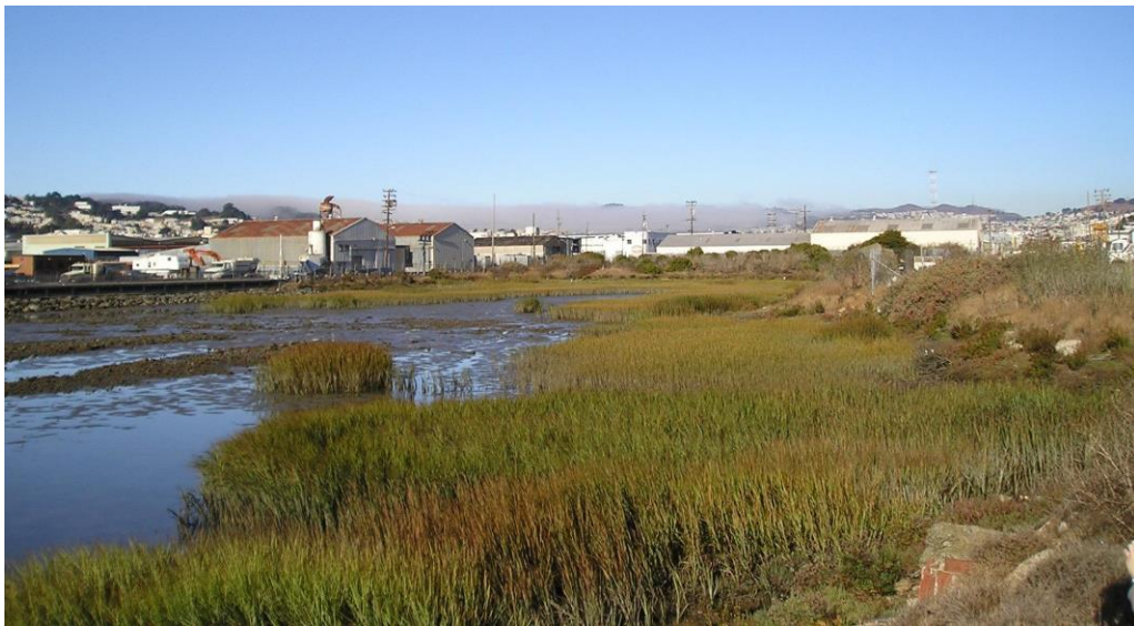
The complete tidal marsh ecosystem includes subtidal areas, tidal flats, tidal marsh, and transition zones.