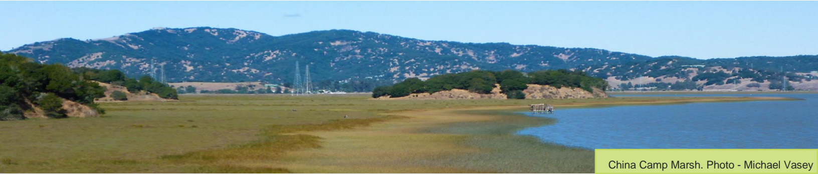
China Camp Marsh.