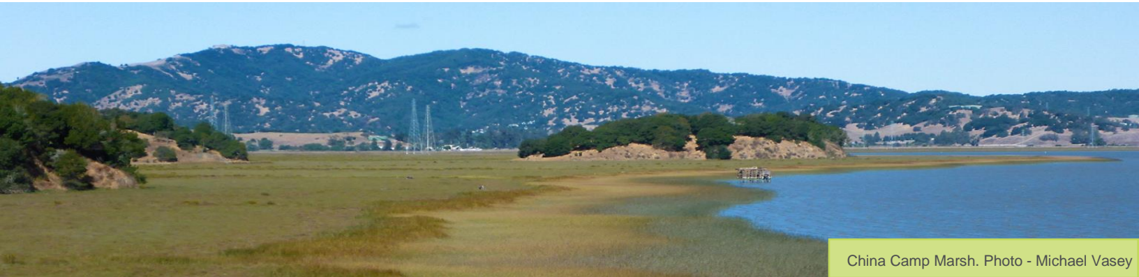
China Camp Marsh.