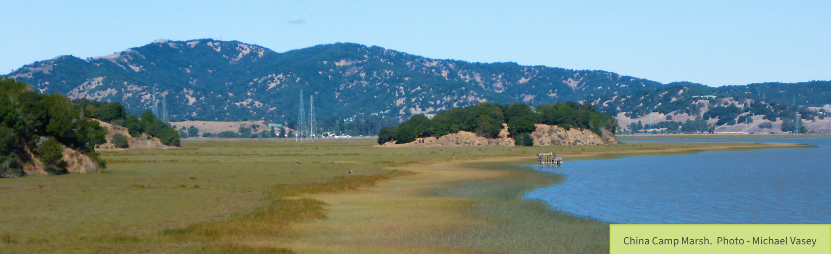
China Camp Marsh.